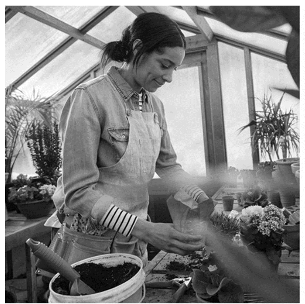
Blue Preferred Gold PPOSM 901