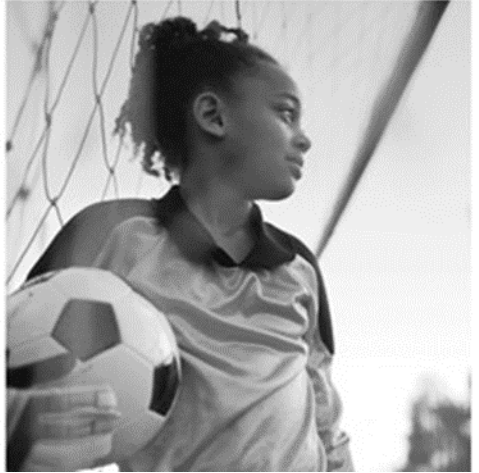
Blue Cross and Blue Shield of Montana, a Division of Health Care Service Corporation, a Mutual Legal Reserve Company, an Independent Licensee of the Blue Cross and Blue Shield Association

THIS CONTRACT IS NOT A MEDICARE POLICY. If you are eligible for Medicare, review the Medicare Supplement Buyers Guide from Blue Cross and Blue Shield of Montana.