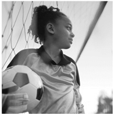
Blue Cross and Blue Shield of Montana, a Division of Health Care Service Corporation, a Mutual Legal Reserve Company

a Mutual Legal Reserve Company, an Independent Licensee of the Blue Cross and Blue Shield Association