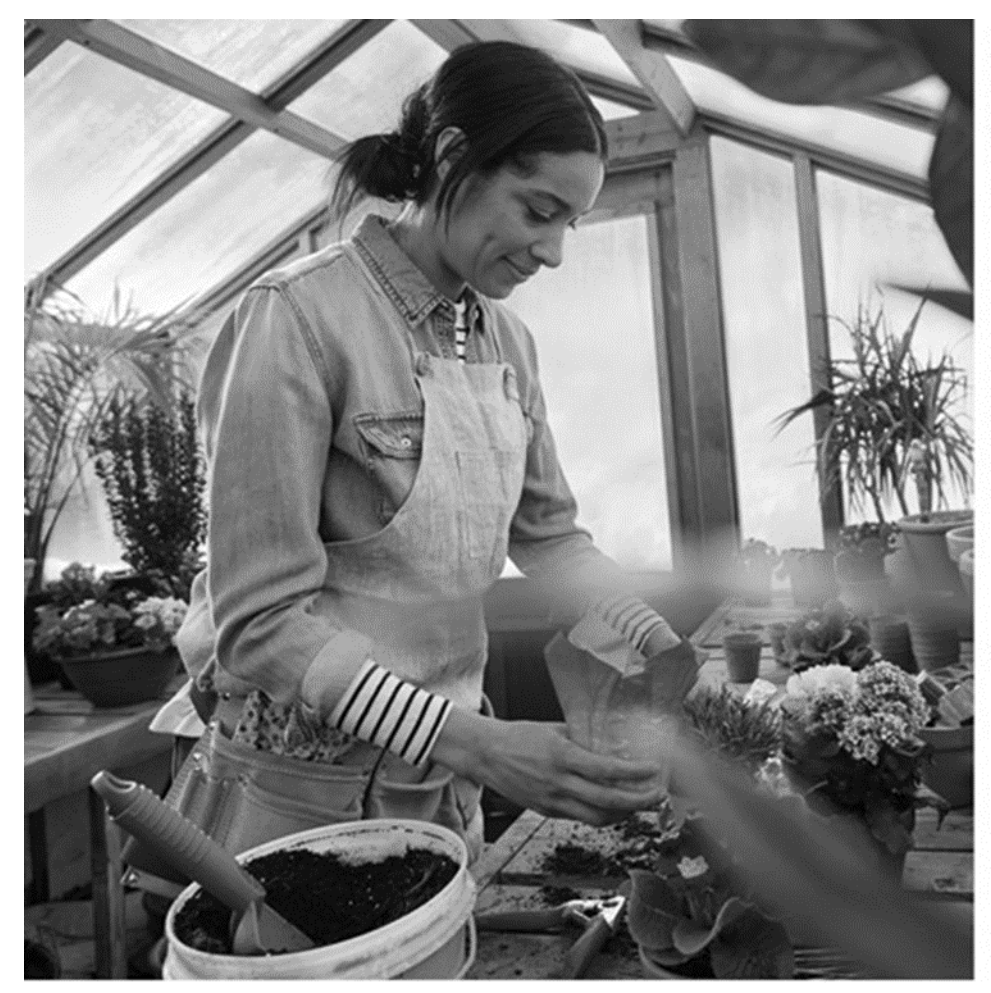
Blue Preferred Bronze PPOSM 201