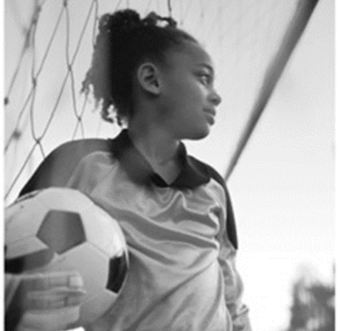
Blue Cross and Blue Shield of Montana, a Division of Health Care Service Corporation, a Mutual Legal Reserve Company, an Independent Licensee of the Blue Cross and Blue Shield Association